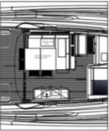
Flying bridge open table